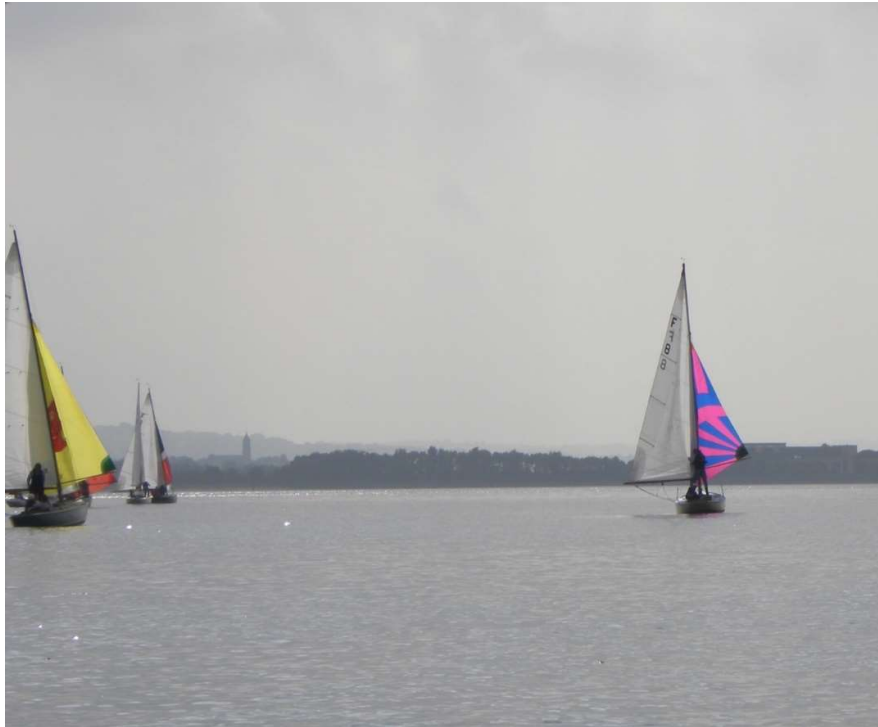
Lorelei just as she 'stopped'

boats caught different patches of breeze the lead changed many times. Lorelei, Maimoune, Minx, Psyche, Snipe and Fiend all held the lead at some point on the beat. Pixie and Sheevra got a bit stuck on the line and were in recovery mode trying to catch the leaders. At one point on the beat, the dinghys were catching the back markers and were in downwind mode with booms fully out as they caught us we were still close hauled. That change in breeze did hit the right side of the beat and at one point Fay and Banshee were both flying kites on the beat! Lorelei rounded first and set off back towards the harbour, opposite HYC clubhouse she ran out of wind and the rest of the fleet closed up and went past her.