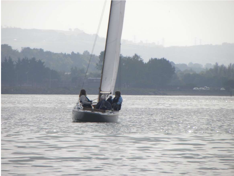
Fiend – (Post sandwich) in the sun

31 st – At last an evening with a pleasant breeze for sailing. Breeze was SSE 10-15kts, very flukey coming back towards the shore. Course set on the water as no OOD appeared was 4-3-home 1 lap. Sheevra led from the start with Pixie and Psyche in close attendance in the outer limit. Fay also on the line but a bit closer to the shore. Pixie flogged her kite for a fair part of the leg, however as we approached Dalchoolin their persistence paid in spades as they overtook Sheevra and rounded in the lead. Lorelei and Minx were up there as well. A large cluster of Fairies arrived together and Finvara lost her overlap as she entered the zone and had to do a wee turn or two after an infringement and she lost several places. On the beat home, Going right paid in the early part of the beat and Sheevra lost a few places by going left, Pixie tried to cover the fleet but boats were spread far left and right. Right side paid for Minx and for Snipe when they came back across the fleet. In the very light and flukey conditions inshore Snipe held on for her maiden victory. Pixie got a second and Minx a third.