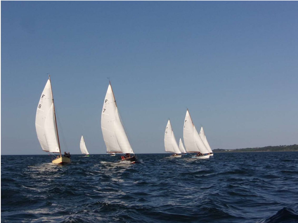
The view from the front – before it all went wrong on F4!

22 nd June – Phowar, what a cracker. Decent offshore breeze 12-20 knots SE. Course was E-4-3-home, 2 laps. At the start those closest to the outer end had a bit of a shouting match. Maimoune gybed round the outer limit and re-started, Fay also went back, although, it transpired she did not need to. Psyche, Sheevra, Fiend and Lorelei were the first boats around the E line. Good hoists across the board saw the fleet moving out towards Killymard. Sheevra sneaked ahead. Shortly after rounding Killymard, spinnakers gybed, wind direction became too tight and spinnakers were dropped.